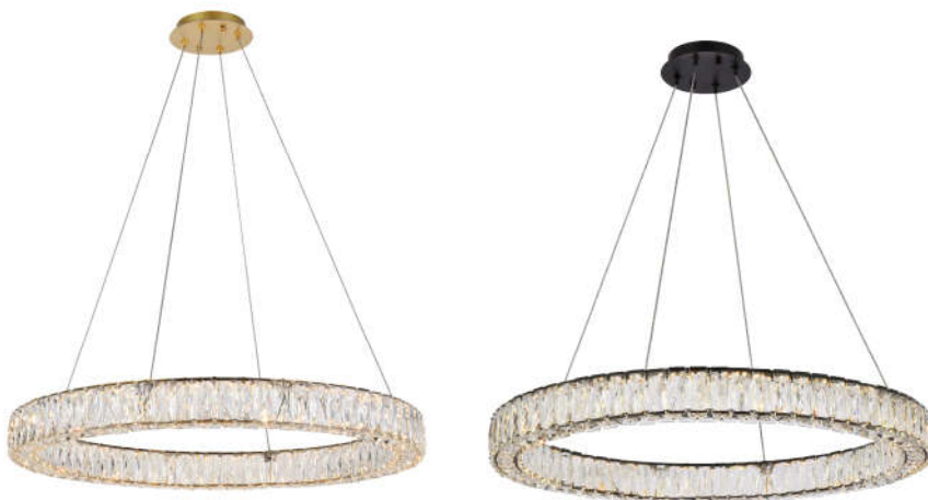
Gold Item No:3503D31G